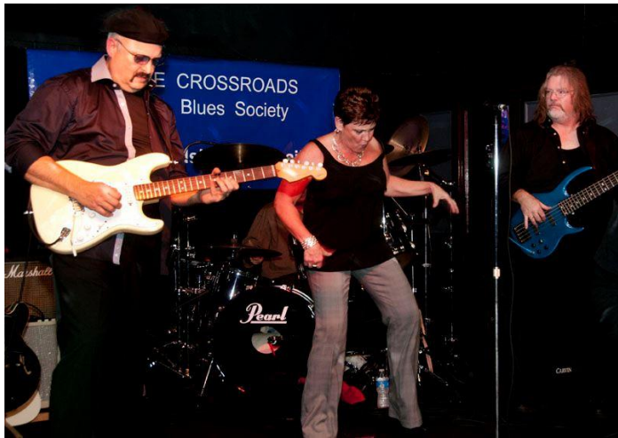
Hurricane Ruth Plays First Friday at Memphis on Main