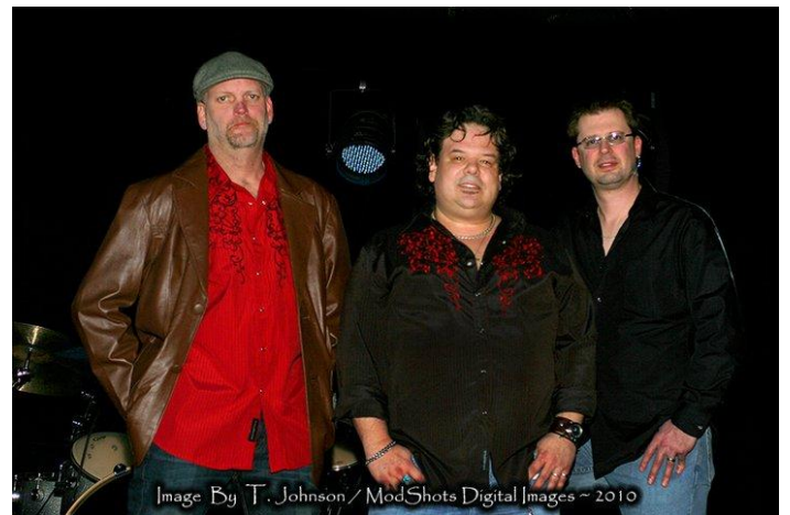
Danny & The Devils

Etta James created great pleasure with her voice and touched many lives. She will be sorely missed.