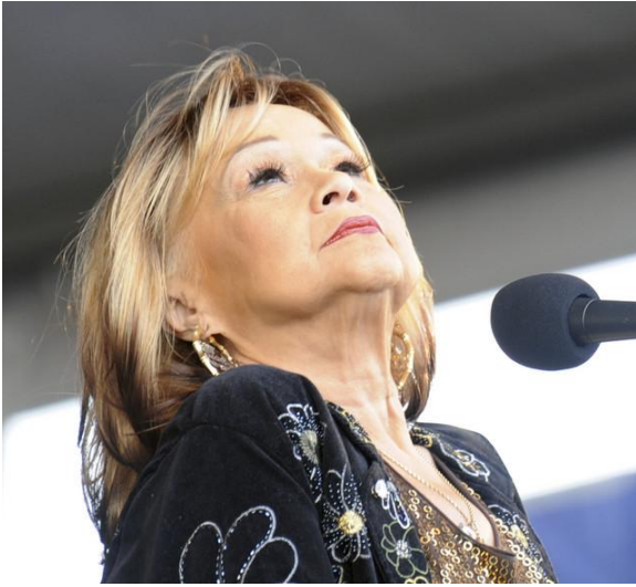
Etta James in 2009