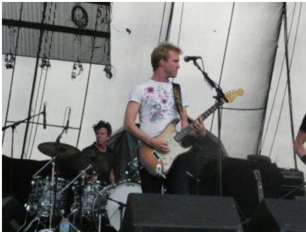
Kenny Wayne Shepard