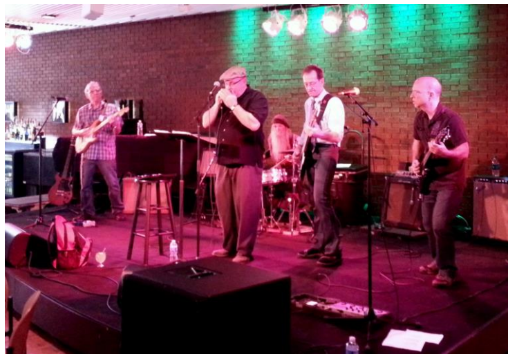
The Painkillers at Krannert Center

This was not your typical Blues crowd. Although all ages were represented, it tended toward middle age and older. Most folks were happily sipping their wine, grooving in their own sedate way with big smiles on their faces. As the evening progressed, I did see a few pockets of overt dancing breaking out on the margins from time to time.