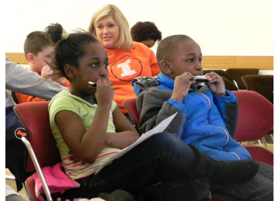
Kids in workshop try some harmonica techniques

Next Doug got the kids going with some basic harmonica instruction, proper position, inhaling and exhaling and playing notes. They tried making some train sounds, since trains were an important part of the great migration north. They had a blast and learned enough to get excited about trying to learn more at home on their own.