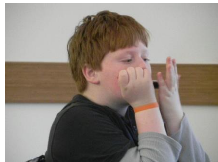
There's that train whistle!

We are grateful to the Orange Krush Foundation for providing the PCBS with funding for the workshop series, and to Samuel Music for the gift of the harmonicas. Remember, there is another workshop planned for Saturday March 30 in the Urbana Free Library, Lewis Auditorium, 1-2 pm.