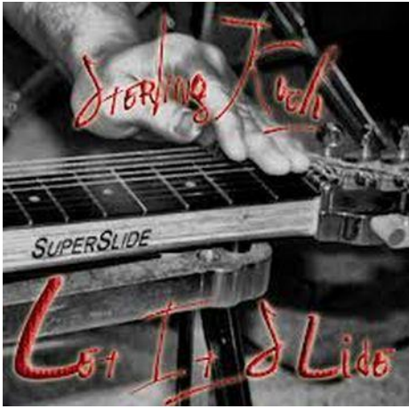
Sterling Koch "Let It Slide"