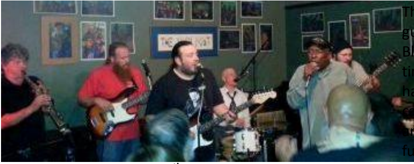
Kilborn Alley at 13 th Anniversary Party