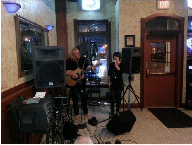
Jiggy & The Source