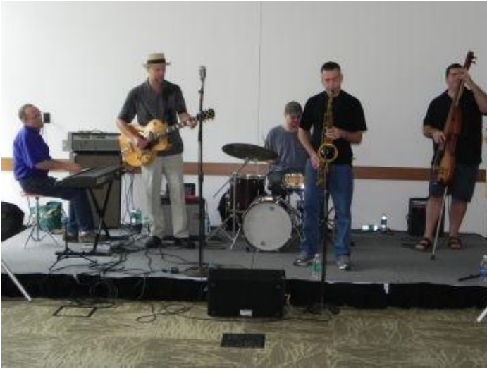
Bruiser and the Virtues at the Champaign Library