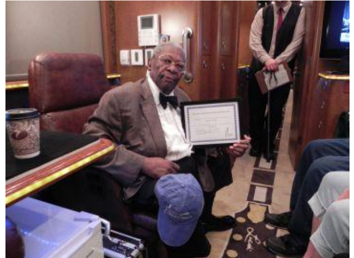
B.B. King, Honorary Member of the PCBS